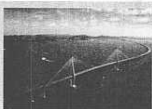
Artist's impression of Incheon Bridge.

The piles were constructed using permanent casings installed through the sea bed into the soft rock to depths of between 38m and 48m, with boring carried out down to a maximum level of -56m using reverse circulation drilling. Up to nine levels of strain gauges and three sections of embedded telltales were incorporated into the test piles.